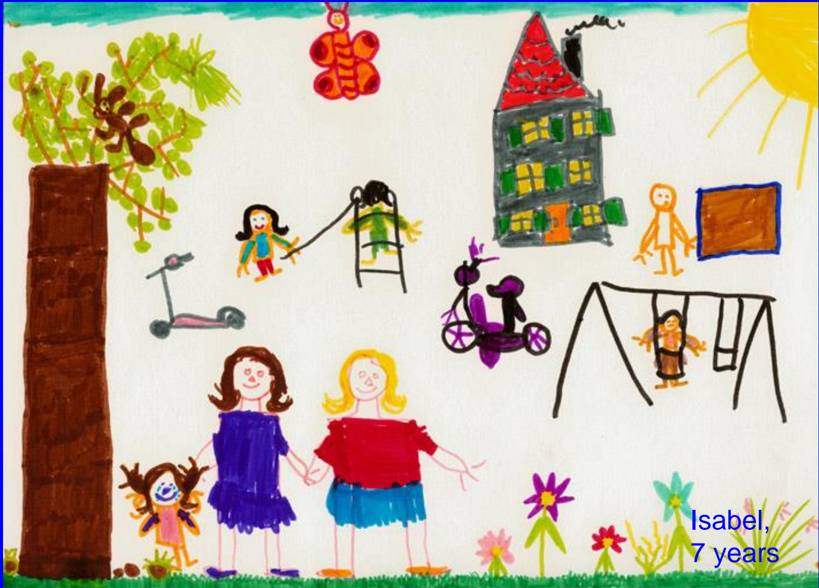
Isabel, 7 years